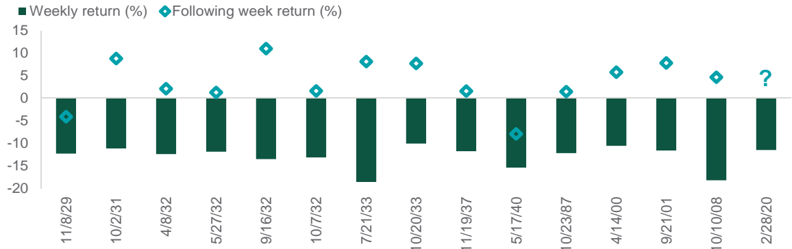
EXHIBIT 4: WHAT COMES NEXT?

The week after a market correction generally sees some consolidation.